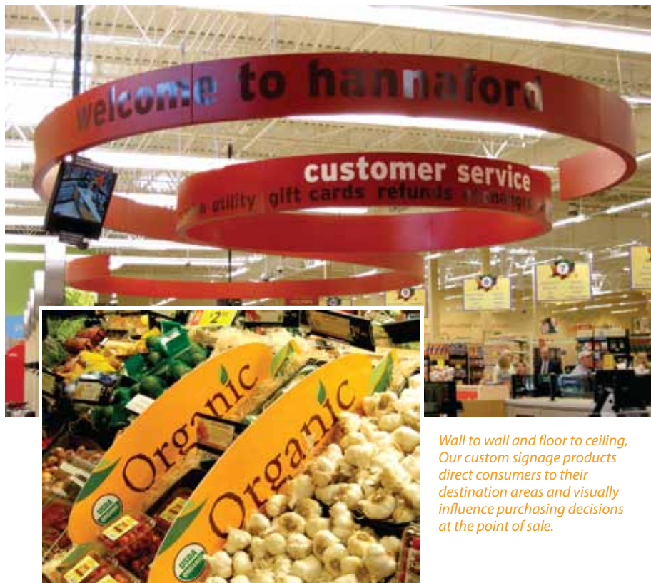
Wall to wall and floor to ceiling, Our custom signage products direct consumers to their destination areas and visually influence purchasing decisions at the point of sale.

From large, full-line superstores to targeted neighborhood markets, Identity Group produces custom sign solutions unique to your environment and in-store marketing plan. Whether your need is one sign or a complete signage program for multiple locations, Identity Group is the solution for wall, hanging, counter, case, fixture, floor and window signs.